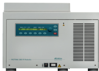
→ Hettich ROTINA 380 centrifuge

The Hettich benchtop centrifuge is available as a standalone system or connected to the fully automated sample preparation systems. Combined with the C+, it will elegantly handle the entire centrifuge process including robotic transfer of tubes to and from TPW / APW, automated speed, time and temperature control, and automated tube "balancing" for uneven sample numbers / weight. The C+ can be ordered with all new TPW / APW systems and is an upgradable addition to existing units.