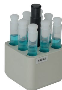
→ Centrifuge bucket with tubes